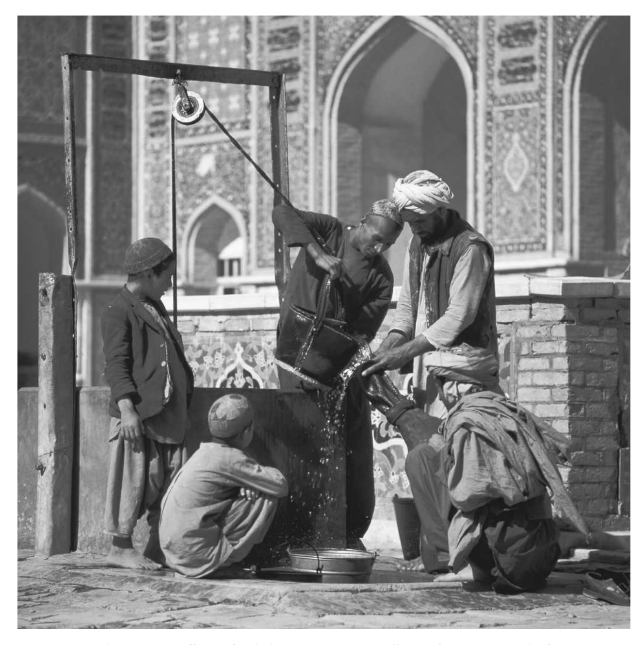
Men gather water from a mosque well. The roles of Afghani men and women differ strongly, both in terms of daily tasks and personal empowerment.

penses. Domestic units are larger among tribal people than among urban dwellers.