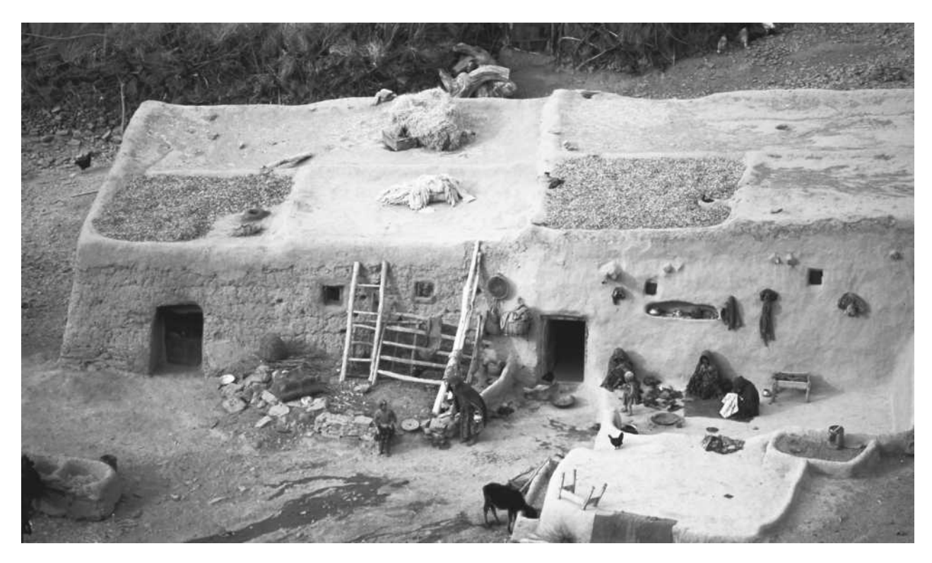
In southern and central Afghanistan, the most common form of housing is a fortified farm built of mud and straw.

agriculture are considered to be of better quality. Wheat is the principal crop, followed by rice, barley, and corn. The main cash crops are almonds and fruits. Cotton was a major export until the civil war. Today, large zones of agricultural land have been converted to poppy cultivation for the heroin trade. Stock breeding is practiced by both nomadic and sedentary peoples. Nomads spend the summer in the highlands and the winter in the lowlands. Many of them, especially in the east, also trade.