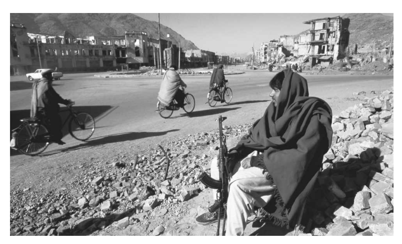
An Afghani man sits in the rubble of Kabul, Afghanistan in 1995. Between 1992 and 1995, the Taliban seized control of southern Afghanistan.

(third century B.C.E. to the second century C.E.) and the Muslim Ghaznavid and Ghurid dynasties (tenth to the twelfth centuries). It was a base of action for many rulers of India, notably the Mughals.