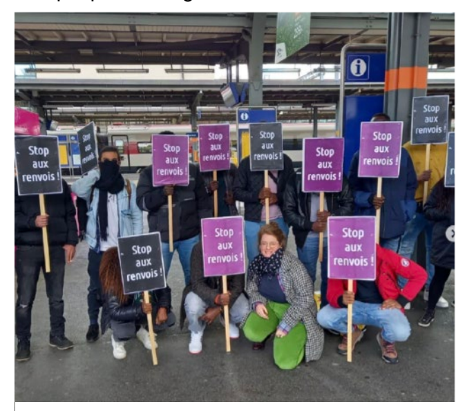
Figure 16. Picture published of protest 3.

However, I could also notice a second way of acting, through a negotiation between this constraint, personal protection, and still a demonstration of presence and political agency in fighting against deportation. This negotiation took place through the physical presence of deportees in disguise by avoiding their personal identification by covering their faces with banners, as the pictures below demonstrate, and also, as could be better noticed onsite, by people wearing masks or other material for face covering, like the person in figure 16.