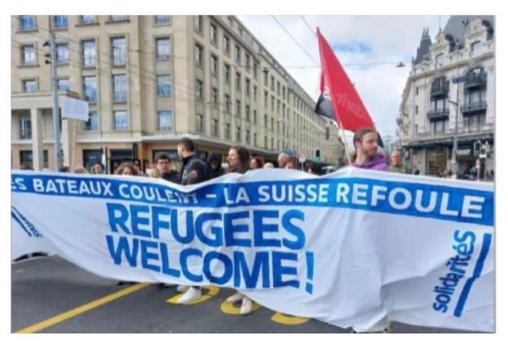
Figure 9. Picture published of protest 3.

Furthermore, other written content present on the protests that also helps us think of the expansion of these collective's purposes were the banners, carried by participants and collective members in the events. Some of them are captured in the pictures below, some taken by me, and some posted on their social media profile: