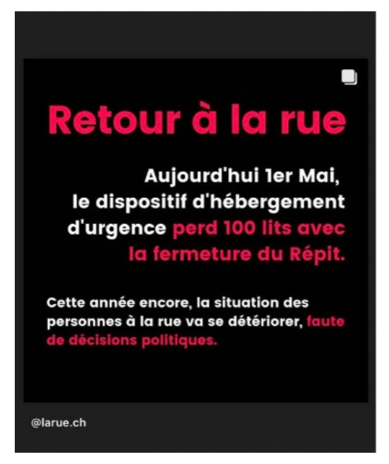
Figure 14. Stories published by Droit de rester.