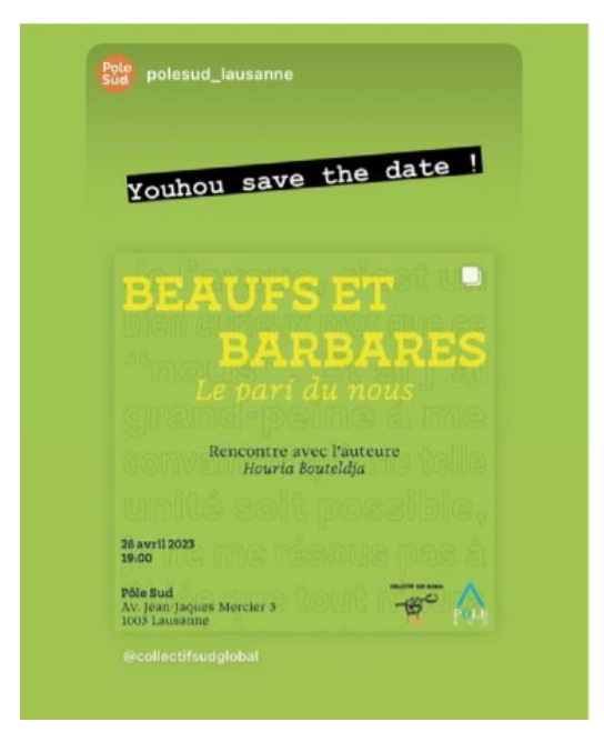
Figure 13. Stories published by Droit de rester.

Through following the collectives on social media, furthermore, a fourth aspect of these movements became interesting to me. I found that often enough, in their Instagram stories, Droit de Rester and Solidarite Tattes would share posts made by other movements, outside the deportation fight. That is, they would advertise in their account other movements focused on human rights, or the anti- racist fights in Switzerland, or against homelessness for example, such as the screenshots below evidence. In this example, specifically, they mention a Collectif du Sud Global, that presents itself as a group against racism, imperialism and colonisation (Collectif du Sud Global, 2023), simply sharing an event about a discussion on a book about racism. In the other story, they share the content of collective la rue, which fights against homelessness.