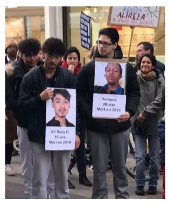
Figure 8. Picture published of protest 2.

The rest of the lines, however, rapidly expand their claims. Still concerning Alireza and other similar cases, the lines "Hospice: injustice"; "Etoile: closure"; and "Hospice, you are evil, the RMNA are on the streets" all refer to the treatment seen being dispensed towards minor migrants who receive a deportation order. In this sense, it is worth explaining that RMNA translates to requérants d'asile mineurs, or minor