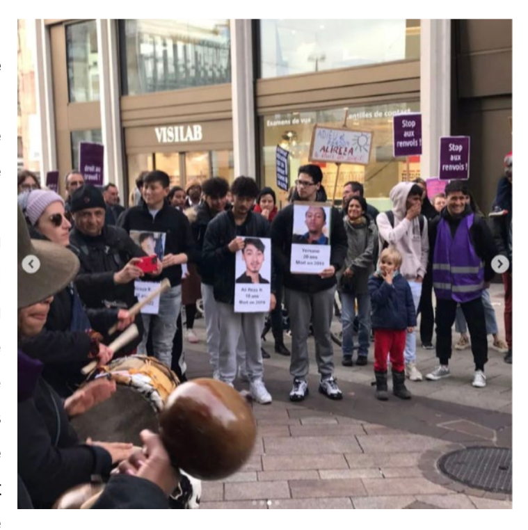
Figure 4. Solidarité Tattes' post after protest 2.

The two later protests, therefore. were much more impactful than the first effectively made themselves be seen and heard. Particularly on the third event, I remember we stopped marching in front of a Burger King diner, which was very full, and all customers inside stopped eating and paid attention to the scene instead, with some stepping outside the restaurant to hear what was being said. In Geneva, when the protest was going through the most commercial part of town, multiple people also stepped out of the shops to see what was happening. Later,