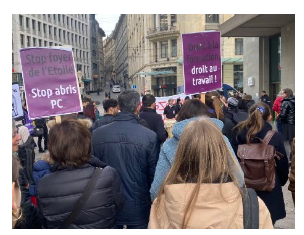
Figure 12. Picture of protest 2.