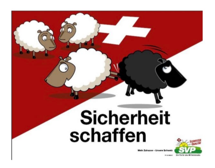
Figure 2. SVP 2007 propaganda against migration. Photograph from Barfuss, 2022.

threat in Switzerland. In fact, according to Barfuss (2022), überfremdung, the racialization of the idea of threat and the securitization of migration all come together in Switzerland through measures like the 2008 Swiss People's Party Deportation Initiative, which now successfully regulates the granting of deportation as a penalty for foreigners convicted for crimes, be they serious offenses like homicide or rape, but also lighter crimes such as robbery or improperly receiving social insurance. One of the posters for such campaign, she continues, became controversial for depicting three white sheep, in Swiss territory (demarcated by the Swiss flag), kicking out a black sheep, with the slogan "Creating Safety" (image below). In this initiative, it becomes clear that deportation in the Swiss context is becoming an increasingly implemented regulation to govern migrant bodies, here, clearly supported by a securitized and colonial narrative.