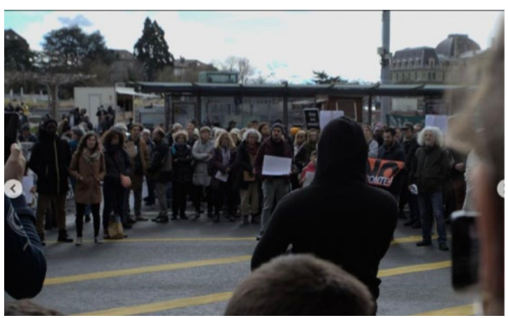
Figure 10. Picture published of protest 3.