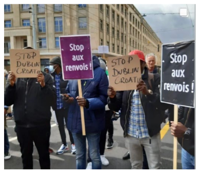
Figure 16. Picture published of protest 3.