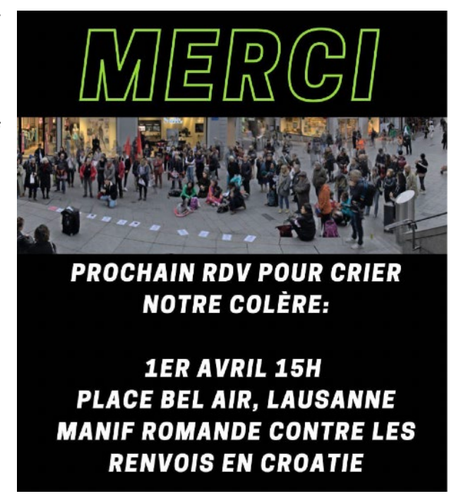
Figure 3. Droit de Rester's post after protest 1

impression However, this of quietness and non-disturbance of the first protest was not the same as I had when I attended the other two events. In both of them, I felt like not only people participating but people around the scene noticed and were impacted by what was happening. In this sense, it is worth mentioning that the second protest had around 300 participants (Solidarité Tattes, 2023c) and lasted around an hour and a half, while the third had 1000 participants and lasted more than 3 hours (Droit de Rester, 2023h). In effect, only in scale, these two other protests were much more significant than the first. Additionally, the fact that they chose to march also