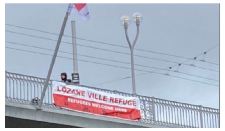
Figure 11. Picture published of protest 3.