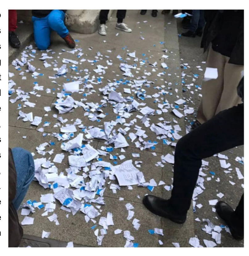
Figure 5. Solidarité Tattes' post after protest 2.

In this sense, two in attended, protests people's behavior on the streets was disruptive and symbolic - being loud, physically blocking important pathways in Geneva and Lausanne, ending the march at the Hotel de Ville, ripping apart F visas, were all ways in which protesters acted to make themselves noticeable to the general public, and get their message across. Therefore, practice, these in actions come across as more significant than the impression literature gives. If in fact there was a continuum between NGOs and the State in relation to deportation