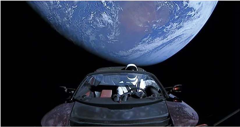
Figure 2: Tesla’s “Starman” launched into orbit around the sun.