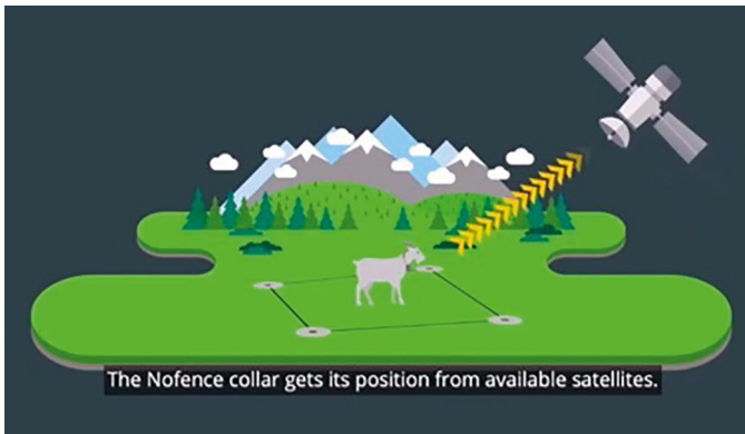
Figure 4: Nofence’s description of its livestock monitoring technologies.

A second articulation of this aesthetic of erasure is found across security technology. Historically, practices linked to security politics (war-fighting, policing, etc.) have been interwoven with technological imaginaries extensively. This is still evident in the ways governments parade their latest high-tech fighter jets, drones, or weapons systems. However, as security politics has proliferated and infiltrated almost every aspect of our lives, such an aesthetic becomes problematical. Armed drones gleaming in the sky with aggressive names and sharp angles are acceptable when they are flying over far-away places to ruthlessly attack clear-cut enemies. They are less aesthetically acceptable at home where security technologies are increasingly—thus—being erased from view. Virtual fencing technologies, for example, draw on a combination of cameras, sensors, and other technologies hidden discretely around cities to feed data to algorithms that can ‘automatically’ detect intrusions into protected spaces. In this they allow citizens to ‘forget’ the politics of insecurity and live a depoliticized life of aesthetic continuity and normality (Austin and Leander, forthcoming). At the same time, these technologies can be ‘visibly’ articulated in the aesthetic practices of governments, commercial actors and others, who cite their presence in speeches, advertise their effectiveness and reassure publics that technology is working ‘behind the scenes’ to keep them safe.