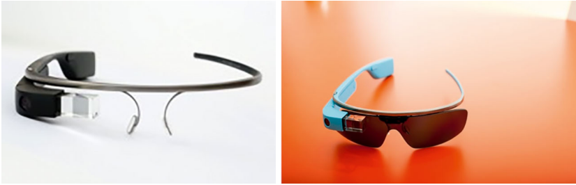
Figure 5: Early (left) and late (right) designs for Google Glass, depicting the shift from a minimalist and futuristic technological aesthetic (that of the classical Californian Ideology) towards an aesthetic of entanglement privileging soft colors, light, and forms (i.e. sunglasses) that domesticate the high-technological into our lives.