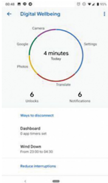
Figure 1: Google's wellbeing (...) A set of 'digital wellbeing' tools now provided in Google's Android platform.

ing problems. But those dangers are things that could (bracketing the reasons for why they are not) be dealt with through regulation. The displeasure we feel with the technological, however, goes deeper towards a fundamental alienation with the ontological place of technology in our lives: with its goals, telos, meanings, and—above all— futures .