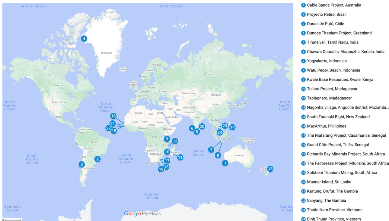
FIGURE 2 The geography of ecological distribution conflicts against heavy minerals sand extractivism across the world. Data source (see section 3 on Methodology); Map constructed using: Google My Maps.

such as mangroves (e.g., EDC20), wetlands, and coastal forests and have important ecological functions, as well as beautiful landscapes (e.g., EDC6, 11, 13), often with endemic species (EDC20, EDC19; Healy 2022), and great aesthetic values (e.g., EDC1). Large-scale mining operations in such regions has resulted in degradation of both marine and coastal ecosystems (e.g., EDC6; EDC7); destabilizing of dunes can result in increased sea water incursion and exposure to extreme weather events (e.g., EDC12); and biodiversity loss as a result of ecological degradation or changes can have significant negative livelihood impacts on local ecosystem-dependent populations (e.g., EDC19). Of the 24 EDCs analyzed, the presence of serious ecological degradation and ecosystem transformations as one main cause of contestations can be identified in not less than 20 cases.