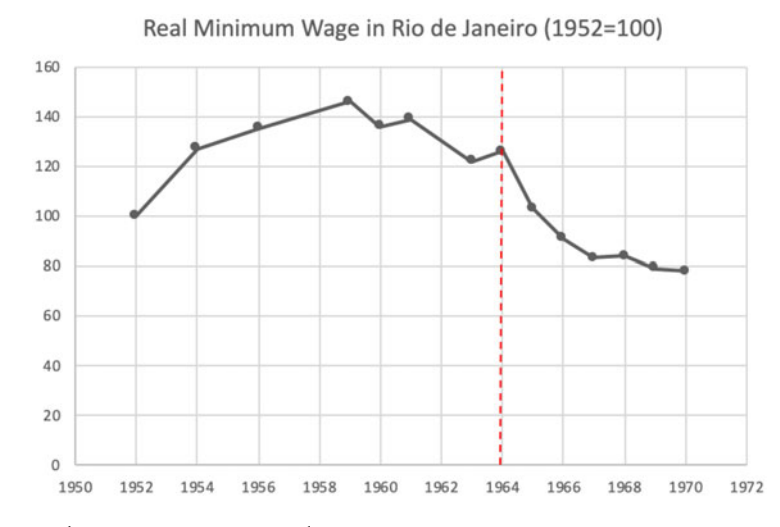
Figure 1. Real minimum wage in Rio de Janeiro, 1952–70 Source: Lara Resende (1982) p. 779, based on IBGE Anuário Estatístico do Brasil.

unequal treatment that these two fairly similar plans received from international creditors (Ribeiro 2006). Thanks to 'generous' external support, Castello Branco's economic plan avoided the 'external strangulation' experienced by the earlier plan (Bastian 2013, p. 159), thereby alleviating the pressure on the balance of payments, which remained in equilibrium in 1964 (US$2 million deficit) and in surplus in 1965 (US$218 million) compared to a substantial deficit in 1962 (US$118 million in 1962) and 1963 (US$37 million) (Bastian 2013, p. 164).