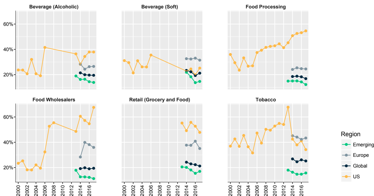
Figure 3: How much of the stock is held by institutional investors? Share in all 'shares outstanding' by sector and region, 2000–17

Notes: Emerging refers to Argentina, Botswana, Bulgaria, Cameroon, China, Croatia, Hong Kong, India, Kenya, Malaysia, Namibia, Netherlands Antilles, Peru, Russia, South Africa, South Korea, Sri Lanka, Trinidad & Tobago, Vietnam, Zambia, Chile, Israel, Mauritius, Philippines, Taiwan, Bangladesh, Brazil, Colombia, Egypt, Indonesia, Ivory Coast, Jamaica, Jordan, Lithuania, Mexico, Morocco, Nigeria, Oman, Pakistan, Qatar, Saudi Arabia, Serbia, Singapore, Slovenia, Thailand, Tunisia, Zimbabwe, Tanzania. Europe refers to Austria, Denmark, France, Germany, Hungary, Ireland, Italy, Spain, Sweden, United Kingdom, Czech Republic, Poland, Portugal, Turkey, Belgium, Cyprus, Finland, Greece, Netherlands, Norway, Switzerland, Malta.