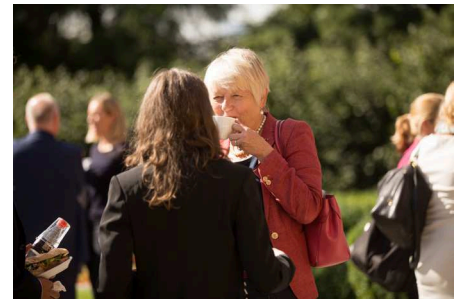
Oslo 2016