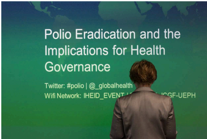
Geneva 2016, © GHC/S. Deshapriya