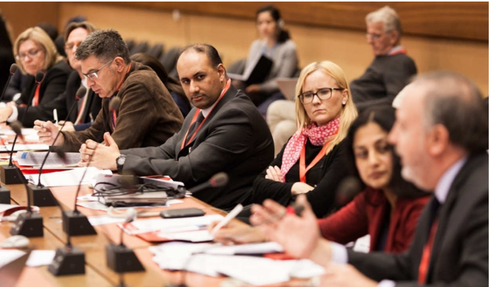
Participants reporting back from their break-out sessions

Participants agreed on the utility of a follow up conference, to foster continued dialogue, and encourage learning across different research domains. A future conference could also bring in experts on research dissemination, to offer practical suggestions on how best to leverage research findings in the policy world, bearing in mind that that “research uptake” should be treated as a serious field of research in its own right.