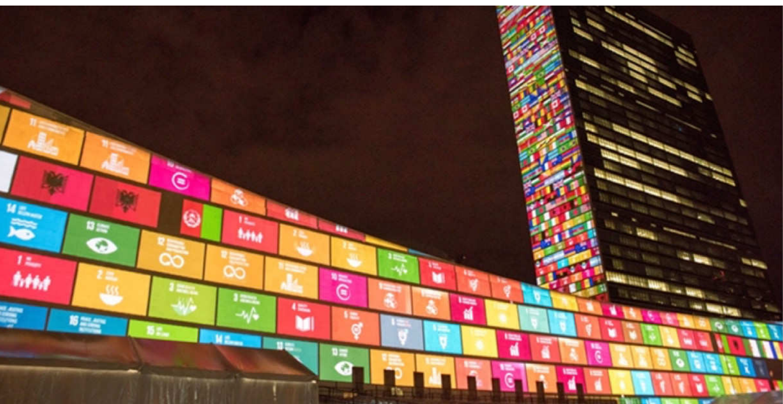
The Sustainable Development Goals projected on UN Headquarters.

The conference also recognized that researchers had a role in identifying pressing challenges which were not yet high on the agenda of the UN system, or member states, but which likely would be so in the foreseeable future. Such research could help the UN and states frame and convene dialogues about issues such as cybersecurity, urbanization, and biotechnology/biosecurity.