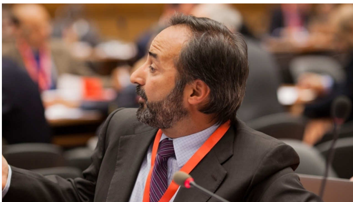
David Haeri, UN Department of Peacekeeping Operations

In the area of development, participants highlighted the need to step up efforts to monitor and evaluate the UN system's development interventions in light of the ambitiousness of the 2030 Agenda, which in turn significantly depends on better availability of data. The conference also highlighted the need for policy researchers to focus on institutional "fitness-for-purpose" questions, and to contribute to policy discussions on how the UN needs to reform the ways in which it is governed, structured, and funded to allow for better implementation of the 2030 Agenda.