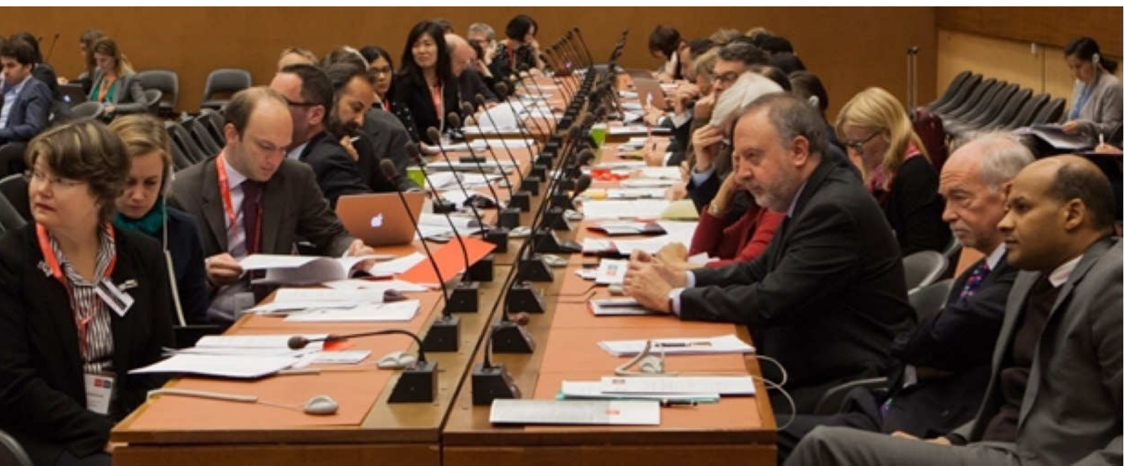
Participants during a plenary session of the “Strengthening the UN’s Research Uptake” conference

Participants also noted that the type of research to be conducted can affect funding decisions. National scientific research funding schemes, for example, do not usually support applied, short-term work which would be more relevant for policy-oriented research required by the UN, but rather favour more systematic, longer-term and academic-oriented projects. For the knowledge community, there are difficulties in obtaining funding for research that challenges, rather than supports, existing policy orthodoxy.