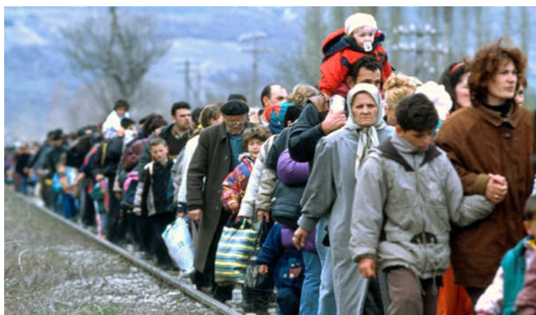
Migrants and refugees in the Balkans.

Migration was highlighted as another area in which policy research has failed to keep pace with the evolution of the challenges. Indeed, in spite of the rise in international migrants and those displaced by conflicts and disasters around the world, which now number 245 million and 65 million, respectively, migration was “understudied and underworked in the UN system.” New research on this topic would need to take into account the global, regional, national and local dimensions of the phenomenon and could, inter alia, offer narratives that could bring to light the positive consequences of migration. Such research should not be done in isolation but also examine the links with other global phenomena such as health, climate change, demographics, and vulnerable groups including youth.