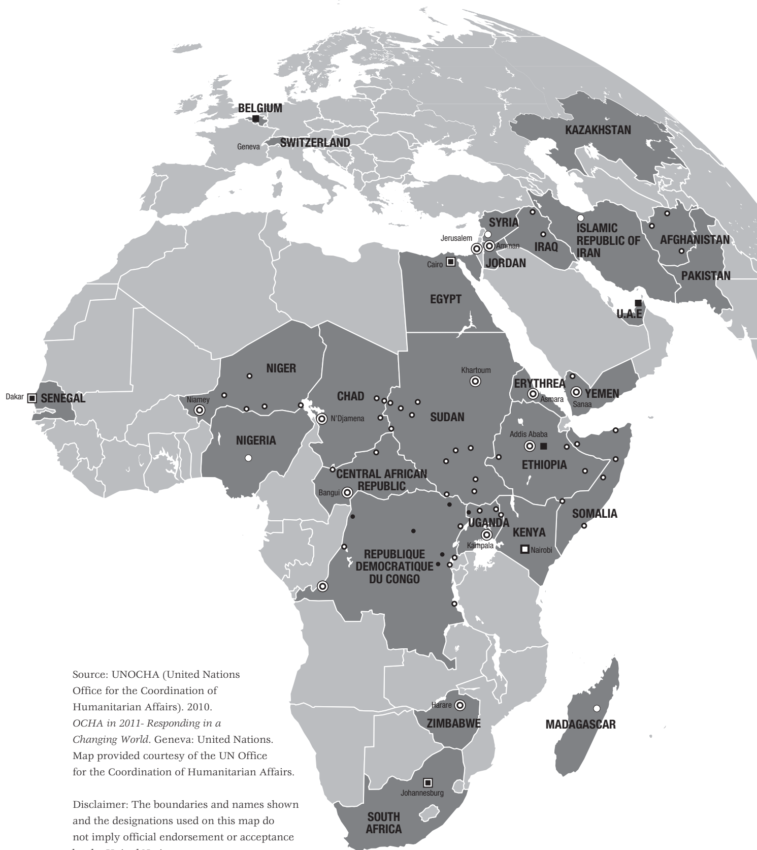
Figure 1 - Linking humanitarian action and peacebuilding: Some of OCHA's presence in Africa