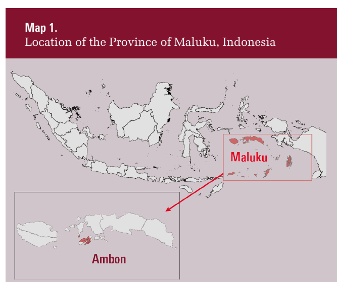
Map produced by Piia Bränfors.

most political offices (Buchanan 2011, 17). The sudden shift in political representation generated tensions, which culminated in communal violence following the fall of Soeharto in 1998. Regional decentralisation in the context of democratic transition further contributed to igniting competition for power between local elites. In this context, an apparently ordinary fight in Ambon between a young immigrant Muslim Bugis man and a young Christian Ambonese angkot (public transportation) driver escalated and sparked a wave of communal violence between 1999 and 2003, during which 1'000 to 3'000 people died (Varshney 2003). The conflict shifted from gang fights into a communal war, with youth militias mobilising along religious lines (Krause 2018). Socio-economic factors, such as high rates of unemployment and high levels of alcohol consumption acted as enabling conditions. In addition, prevalent conceptions of masculinity legitimised a display of violence to prove manliness and project pride in the defence of religion (Malukans have borrowed the Spanish term 'machismo' to describe such behaviour). After years of ethno-religious tensions, efforts of the central government to settle the conflict bore fruit with the Malino II agreement in 2002. Since then, in spite of some eruptions of small-scale violence, the region has been considered at peace.