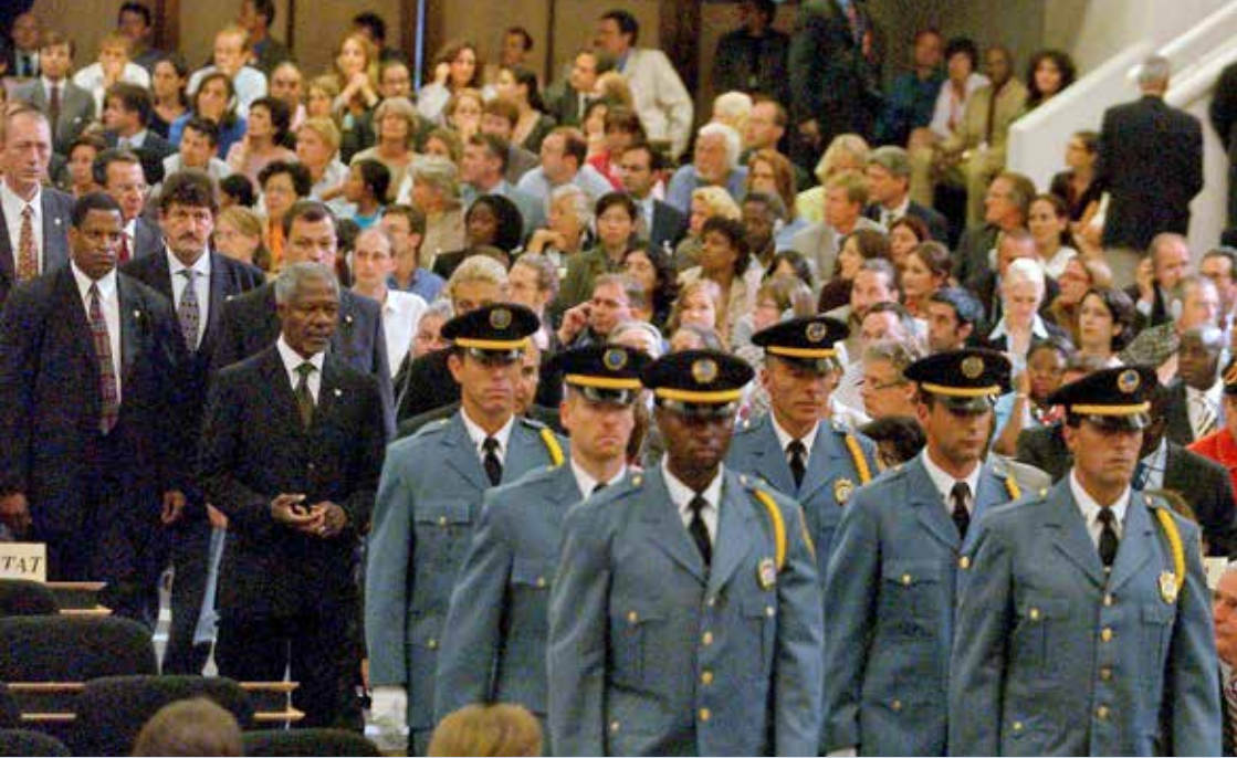
Observance of First Anniversary of Attack on UN Headquarters in Baghdad Secretary-General Kofi Annan (behind the guards, on the left) is being escorted by United Nations Security officers to attend the observance of the first anniversary of the attack on the United Nations headquarters in which 22 staff members gave their lives in the service of the Organization.