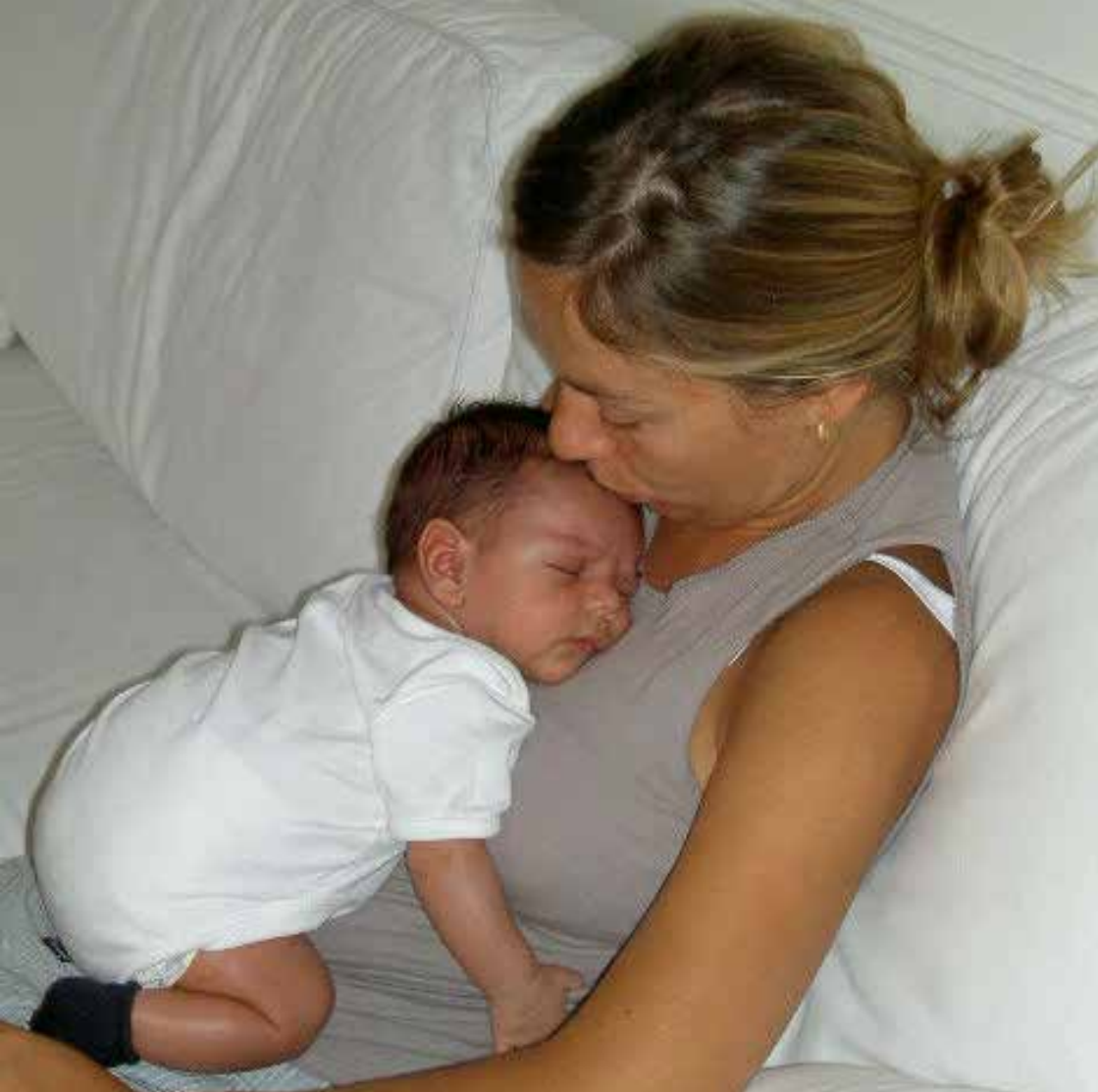
Before the funeral

outside while the train was slowly moving through the sealed off and dust-covered platforms of the station. I spent my childhood in Bolzano, in the Italian border region of South Tyrol, where in those years local separatist movements had caused several bombing attacks, mainly on State infrastructure. On 11 September 2001, I was with Jean-Sélim in New York, locked up for an unbearably long time in the basement of the UN Headquarters, while an enormous mass