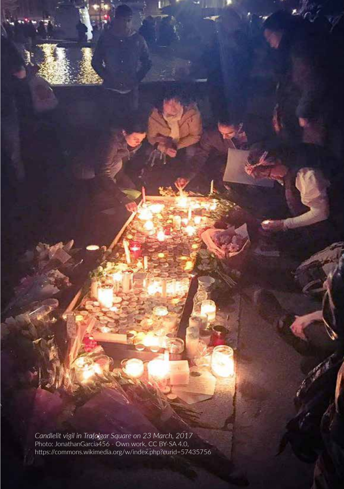
Candlelit vigil in Trafalgar Square on 23 March, 2017