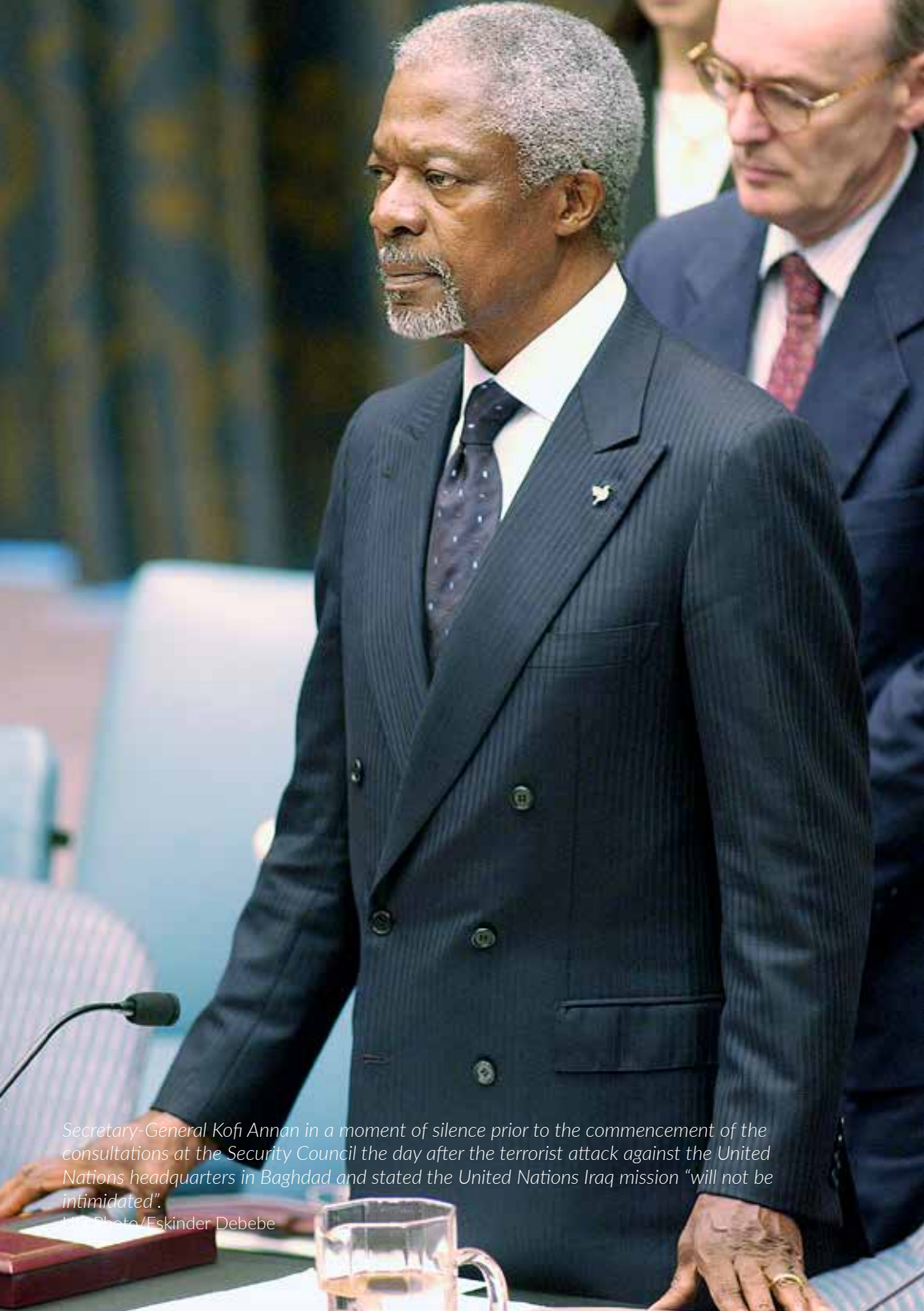
Secretary-General Kofi Annan in a moment of silence prior to the commencement of the consultations at the Security Council the day after the terrorist attack against the United Nations headquarters in Baghdad and stated the United Nations Iraq mission "will not be intimidated".