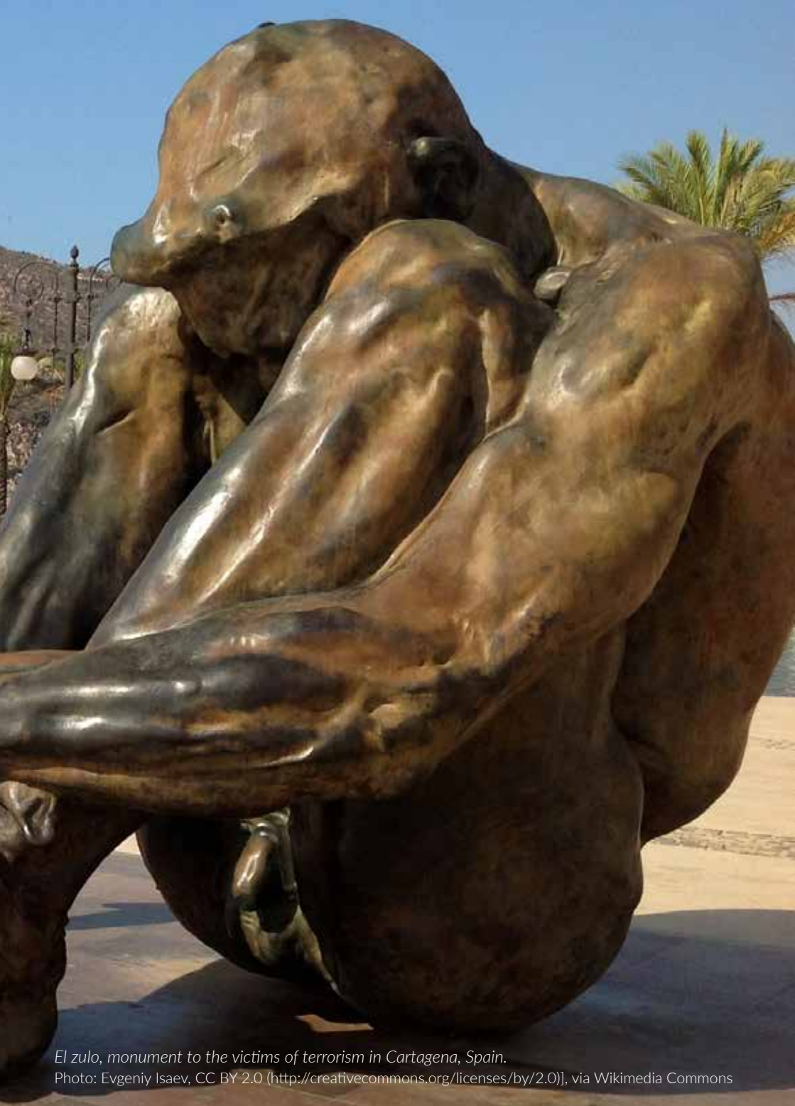
El zulo, monument to the victims of terrorism in Cartagena, Spain.