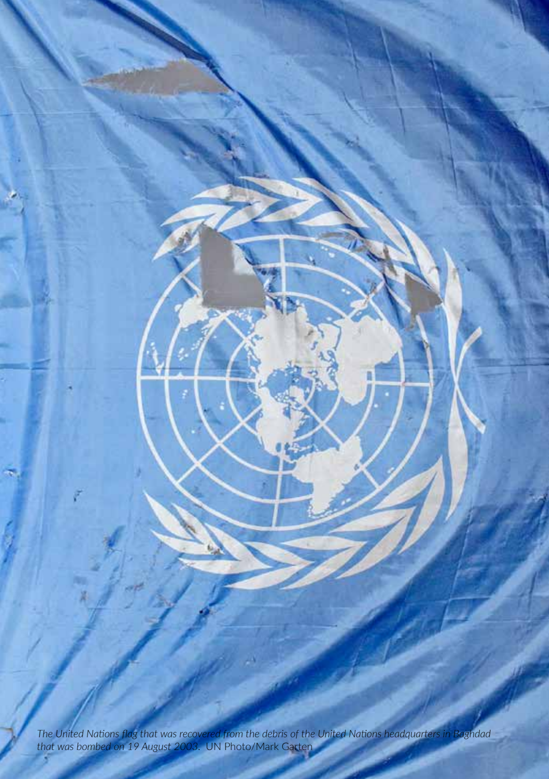
The United Nations flag that was recovered from the debris of the United Nations headquarters in Baghdad that was bombed on 19 August 2003.