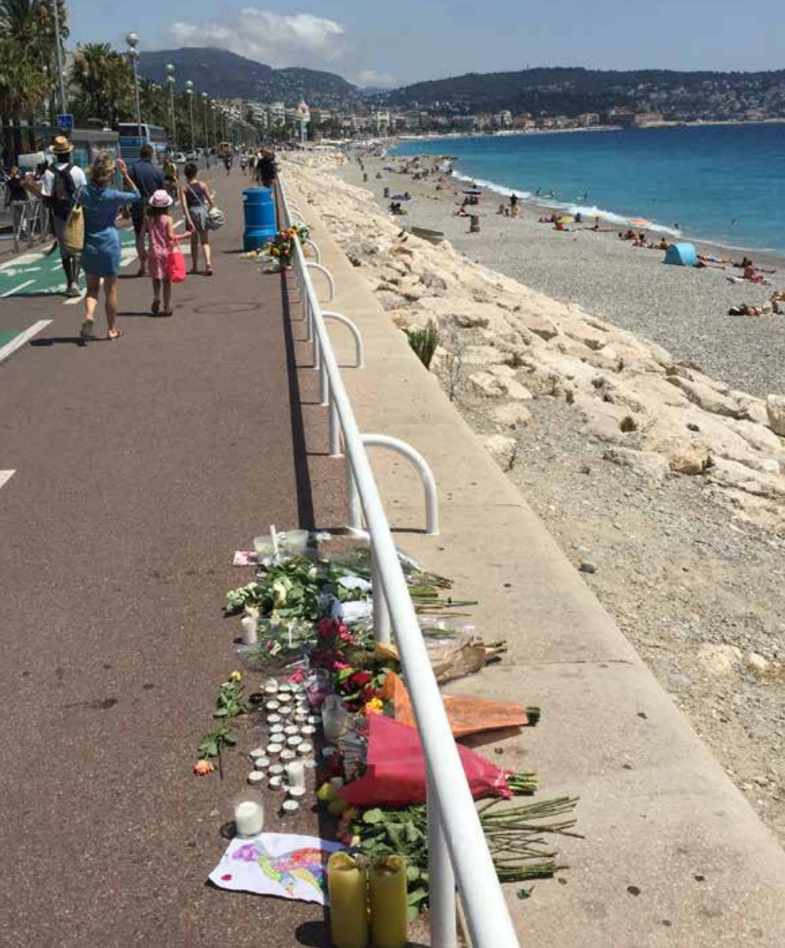
Promenade des Anglais, Nice France after the 14 July 2016 attack.