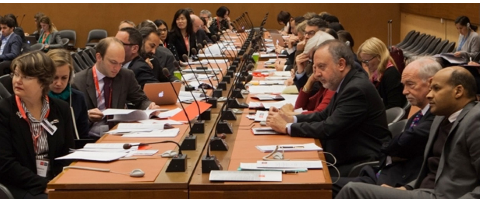
Participants during a plenary session of the “Strengthening the UN’s Research Uptake” conference

Participants also noted that the type of research to be conducted can affect funding decisions. National scientific research funding schemes, for example, do not usually support applied, short-term work which would be more relevant for policy-oriented research required by the UN, but rather favour more systematic, longer-term and academic-orientated projects. For the knowledge community, there are difficulties in obtaining funding for research that challenges, rather than supports, existing policy orthodoxy.