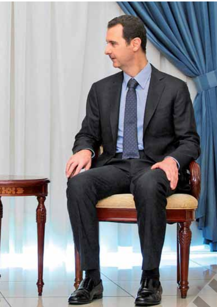
Iranian Foreign Minister Mohammad Javad Zarif (L) meets with Syrian President Bashar al-Assad in Damascus. Jan. 15, 2014

appear to be on the program of the new administration. Tehran kept consolidating its position in the country and doing its best to preserve the Assad regime as the best suitable option both on the ground and during negotiations. In this way, Iran made itself an indispensable actor in the resolution of this conflict. Rouhani emphasized the quest for a political solution to the Syrian conflict. On the diplomatic side, he made efforts for rapprochement with Ankara. The Iranian foreign minister made a visit to the Turkish capital in order to discuss the Syrian question. The increase of groups linked to al-Qaeda in Syria and the related rising Shii-Sunni sectarian conflict led these two countries to develop the prospects of getting closer, although spillover from Syria continued to separate them. 66